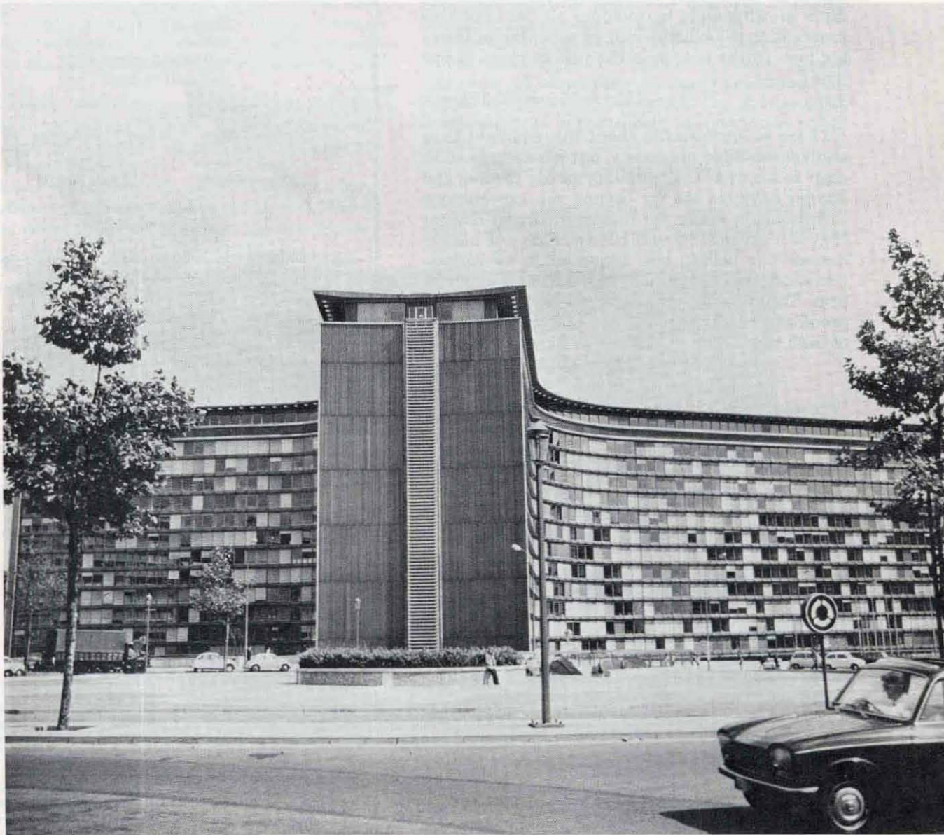
Common Market Headquarters

An International Course of Biblical Understanding