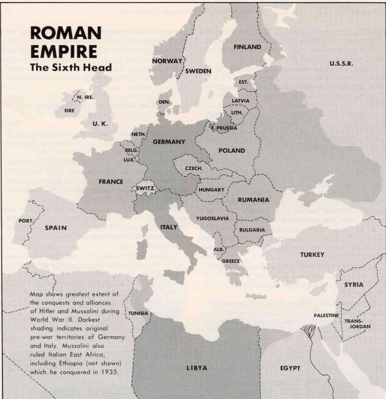
Ambassador College Art

14:11, verse 12 then takes us back to the original fall of Lucifer. For the fall of modern Babylon marks the end of everything Lucifer, now called Satan, has worked for on this earth for thousands of years. He is pictured as the actual "king" (verse 4) of the entire Babylonish system because he completely controls the human king described in Isaiah 14:16-20 and in Revelation 19:20.