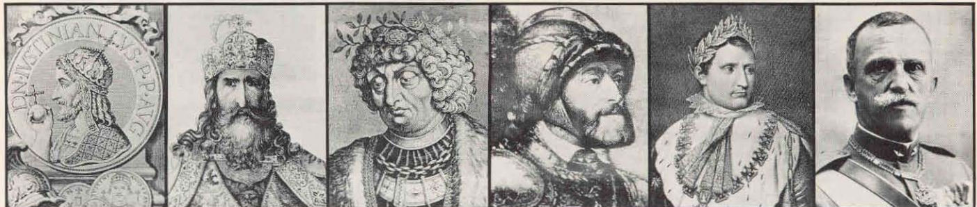
JUSTINIAN, author of "Imperial Restoration" of Roman Empire, 554 A.D.